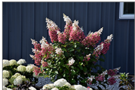
Pinky Winky Hydrangea in bloom