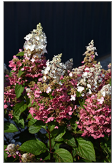
Pinky Winky Hydrangea flowers