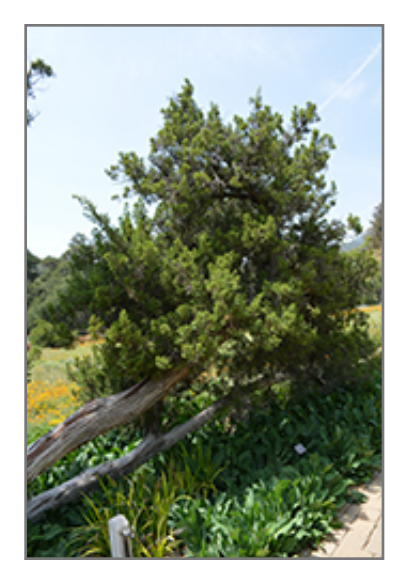
California Juniper