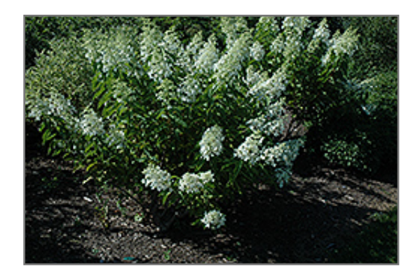
White Caps Hydrangea in bloom