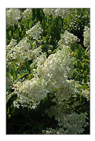
White Caps Hydrangea flowers