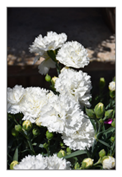
SuperTrouper White Carnation flowers

Double, pure white miniature carnations with lightly frilled edges bloom consistently over a long season, especially in warmer climates; great for border fronts, containers, and floral arrangements