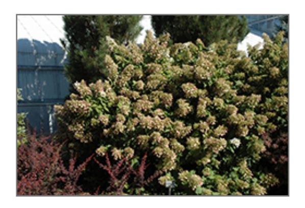
Burgundy Lace Hydrangea in bloom