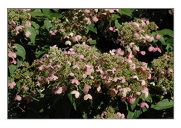
Burgundy Lace Hydrangea flowers

This shrub performs well in both full sun and full shade. It prefers to grow in average to moist conditions, and shouldn't be allowed to dry out. It is not particular as to soil type or pH. It is highly tolerant of urban pollution and will even thrive in inner city environments. Consider applying a thick mulch around the root zone in winter to protect it in exposed locations or colder microclimates. This is a selected variety of a species not originally from North America.