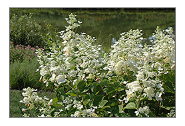
Burgundy Lace Hydrangea flowers