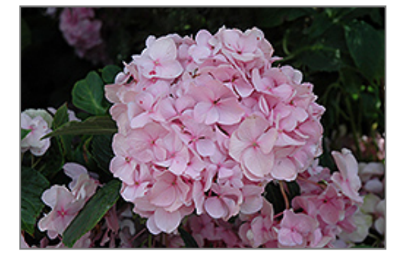
All Summer Beauty Hydrangea flowers

All Summer Beauty Hydrangea features bold balls of blue flowers with shell pink overtones at the ends of the branches from early summer to mid fall. The flowers are excellent for cutting. It has dark green deciduous foliage. The glossy pointy leaves do not develop any appreciable fall colour.