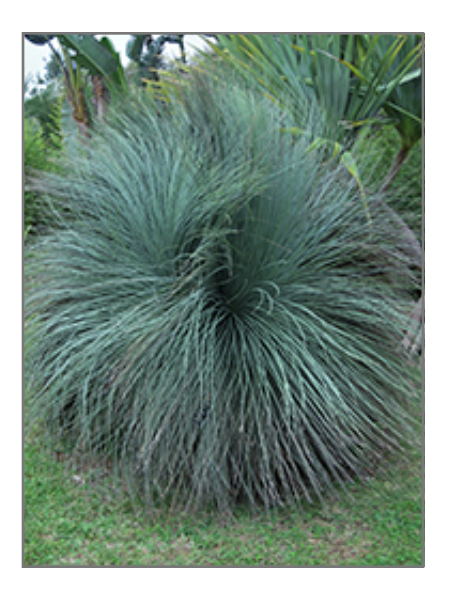
Austral Grass Tree