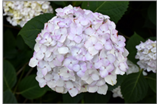
Blushing Bride Hydrangea flowers