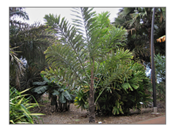
Distichous Fishtail Palm

Distichous Fishtail Palm will grow to be about 30 feet tall at maturity, with a spread of 20 feet. It has a low canopy with a typical clearance of 3 feet from the ground, and should not be planted underneath power lines. It grows at a fast rate, and under ideal conditions can be expected to live for approximately 20 years.