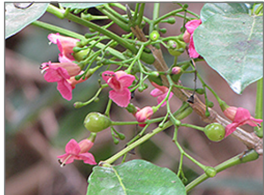
Puriri flowers