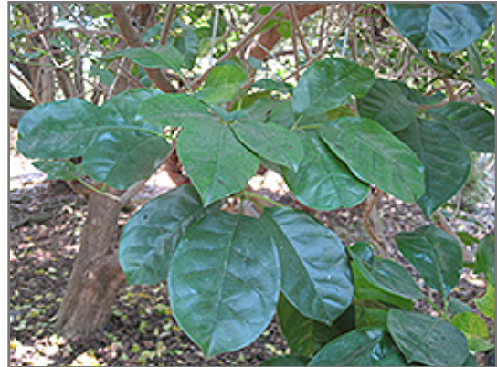
Puriri foliage

Puriri is a dense evergreen tree with a more or less rounded form. Its relatively coarse texture can be used to stand it apart from other landscape plants with finer foliage.