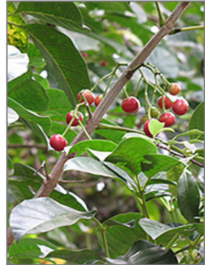
Puriri fruit

This tree does best in full sun to partial shade. It does best in average to evenly moist conditions, but will not tolerate standing water. This plant should not require much in the way of fertilizing once established, although it may appreciate a shot of general-purpose fertilizer from time to time early in the growing season. It is not particular as to soil type or pH, and is able to handle environmental salt. It is highly tolerant of urban pollution and will even thrive in inner city environments, and will benefit from being planted in a relatively sheltered location. This species is not originally from North America.