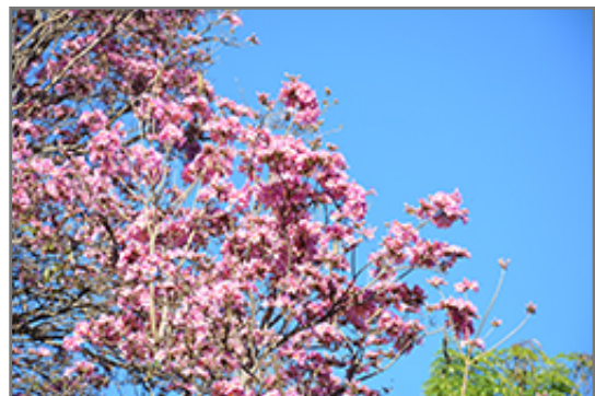
Pink Trumpet Tree flowers