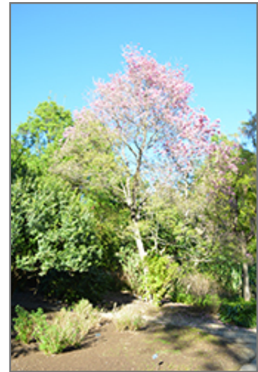
Pink Trumpet Tree in bloom

Pink Trumpet Tree is recommended for the following landscape applications;