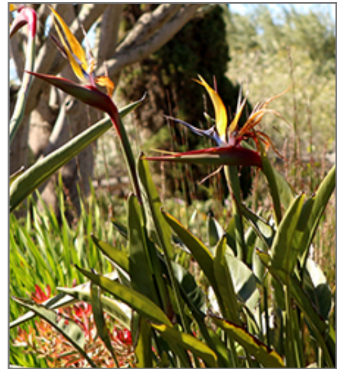
Mandela's Gold Bird Of Paradise flowers

A beautiful and bold structural plant that forms a large clump of stiff, upright oval foliage; stunning flowers of golden-orange and royal blue rise high above the foliage, giving the appearance of a bird's head; great cut flower; shelter from frost