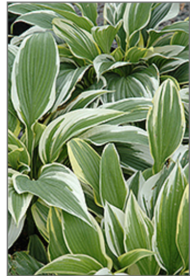
White-Variegated Hosta foliage