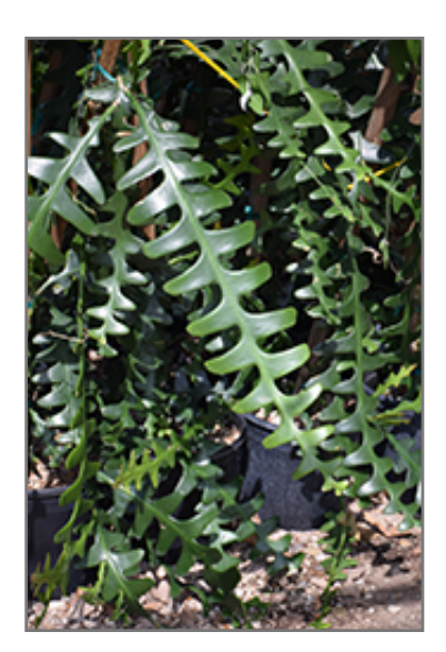
Fishbone Cactus foliage

Fishbone Cactus is a succulent evergreen plant. It is an atypical member of the cactus family known as an 'epiphyte' or 'air plant', which means that it doesn't necessarily require a growing medium for its roots. Like all other cacti, it doesn't actually have leaves, but rather modified succulent stems that comprise the bulk of the plant. This particular variety of cactus is valued for its spreading habit of growth on a plant consisting of This plant features showy fragrant fuchsia star-shaped flowers with white overtones and gold eyes along the stems from late spring to early summer.