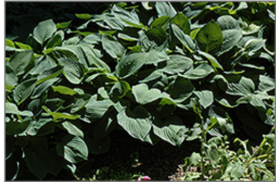
Hyacinthina Hosta