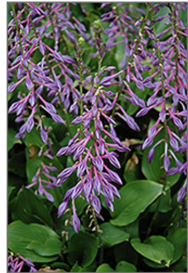
Closed-Flower Hosta flowers