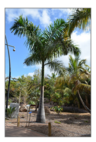
Morass Royal Palm

This tropical plant should only be grown in full sunlight. It prefers to grow in moist to wet soil, and will even tolerate some standing water. This plant should not require much in the way of fertilizing once established, although it may appreciate a shot of general-purpose fertilizer from time to time early in the growing season. It is not particular as to soil pH, but grows best in rich soils, and is able to handle environmental salt. It is highly tolerant of urban pollution and will even thrive in inner city environments. This species is not originally from North America.