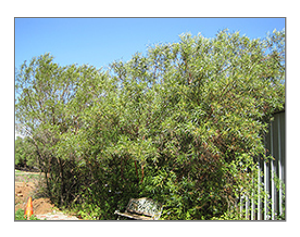
African Sumac

A large, upright evergreen shrub or small tree with weeping branchlets; narrow, willow-like foliage is dark green above and pale gray-green below; clusters of yellow-green flowers in spring, followed by round fruit; considered invasive in some areas