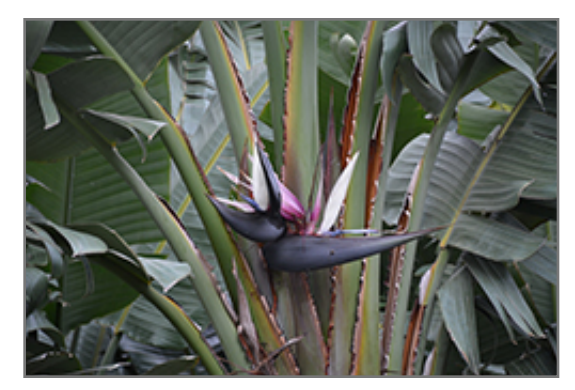
Traveller's Palm flowers