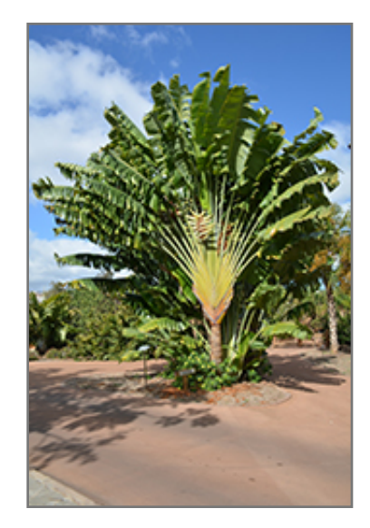
Traveller's Palm

This tropical plant should only be grown in full sunlight. It does best in average to evenly moist conditions, but will not tolerate standing water. This plant should not require much in the way of fertilizing once established, although it may appreciate a shot of general-purpose fertilizer from time to time early in the growing season. It is not particular as to soil pH, but grows best in rich soils. It is somewhat tolerant of urban pollution. This species is not originally from North America..