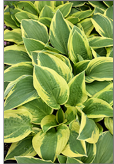
Wide Brim Hosta foliage