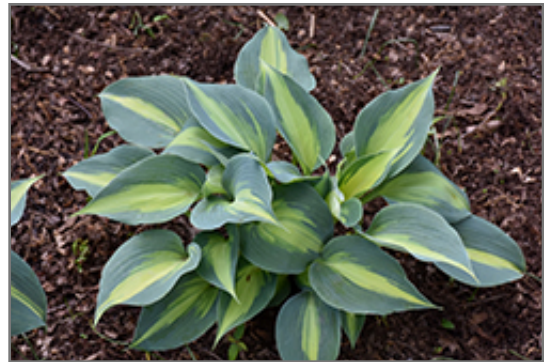
Touch Of Class Hosta

Touch Of Class Hosta is recommended for the following landscape applications;