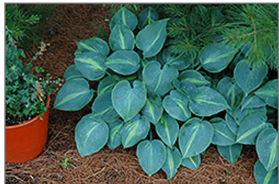
Touch Of Class Hosta