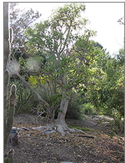
Ombu Tree