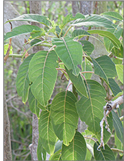
Ombu Tree foliage

This is a relatively low maintenance tree, and can be pruned at anytime. It is a good choice for attracting birds to your yard. It has no significant negative characteristics.