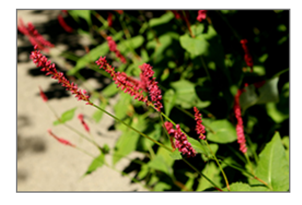
Mountain Fleece flowers

Mountain Fleece is recommended for the following landscape applications;