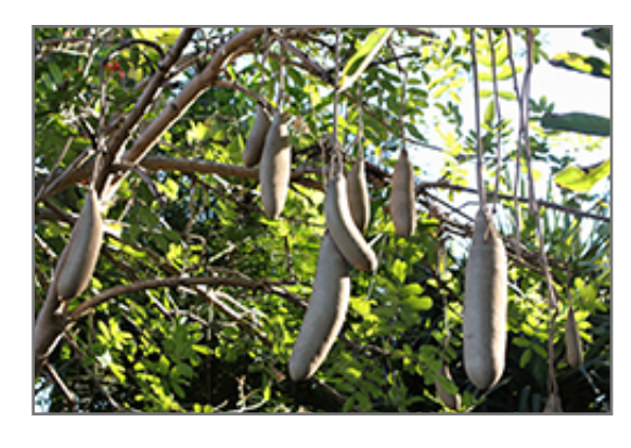
Sausage Tree fruit

Sausage Tree is a multi-stemmed evergreen tree with an upright spreading habit of growth. Its relatively coarse texture can be used to stand it apart from other landscape plants with finer foliage.