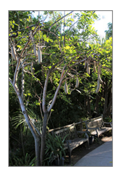
Sausage Tree

This is a relatively low maintenance tree, and is best pruned in late winter once the threat of extreme cold has passed. It is a good choice for attracting birds, bees and butterflies to your yard. It has no significant negative characteristics.