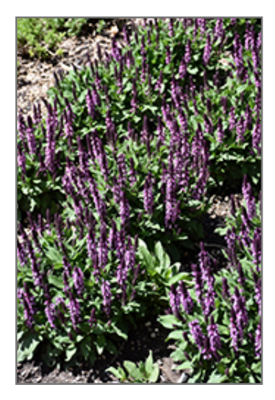
Midnight Rose Meadow Sage in bloom