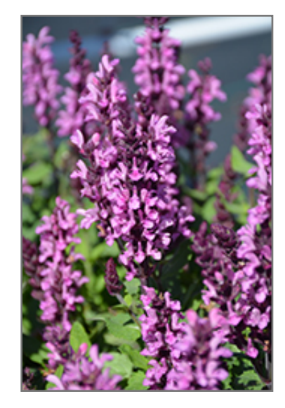
Midnight Rose Meadow Sage flowers

This is a relatively low maintenance plant, and is best cleaned up in early spring before it resumes active growth for the season. It is a good choice for attracting bees, butterflies and hummingbirds to your yard, but is not particularly attractive to deer who tend to leave it alone in favor of tastier treats. It has no significant negative characteristics.