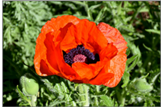
Orange Scarlet Poppy flowers