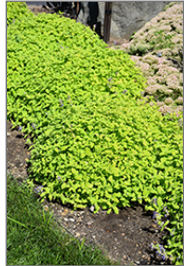
Chartreuse On The Loose Catmint