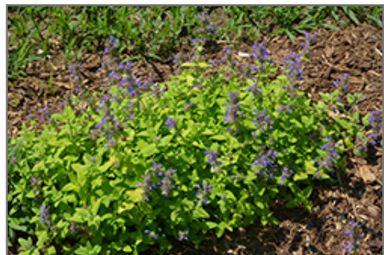
Chartreuse On The Loose Catmint in bloom