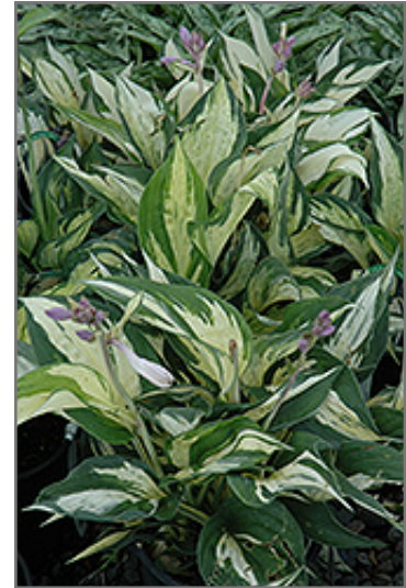
Revolution Hosta in bloom