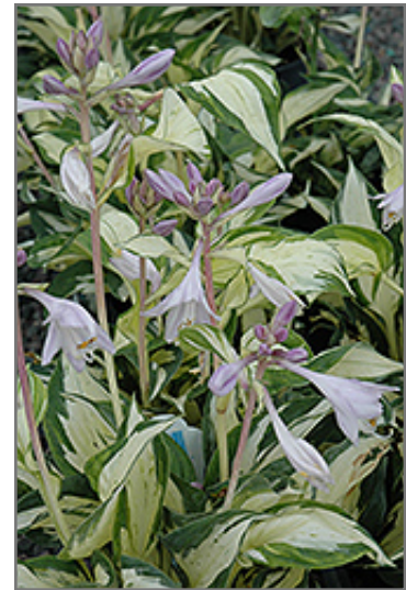
Pathfinder Hosta in bloom