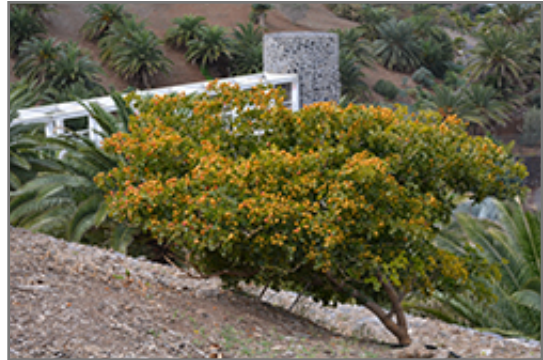
Rough Bark Lignum Vitae fruit

Rough Bark Lignum Vitae is a multi-stemmed evergreen tree with an upright spreading habit of growth. Its average texture blends into the landscape, but can be balanced by one or two finer or coarser trees or shrubs for an effective composition.