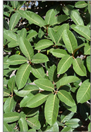
Velutina Fig foliage

This tree will require occasional maintenance and upkeep, and is best pruned in late winter once the threat of extreme cold has passed. It is a good choice for attracting birds and squirrels to your yard, but is not particularly attractive to deer who tend to leave it alone in favor of tastier treats. It has no significant negative characteristics.