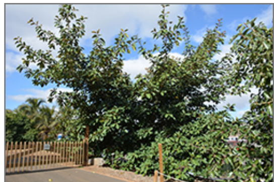
Velutina Fig