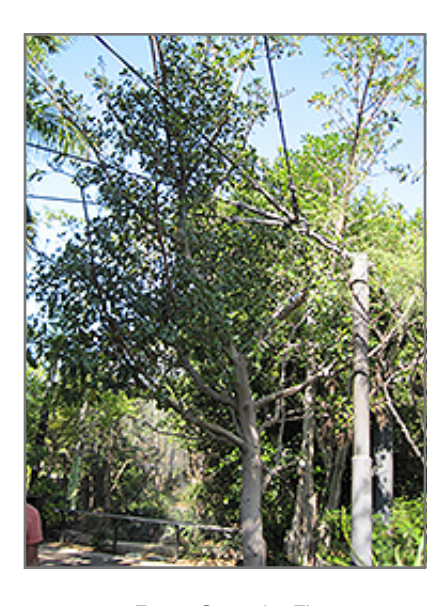
Forest Strangler Fig