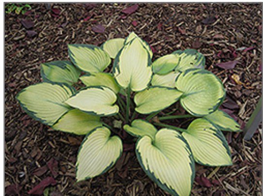
Paradise Joyce Hosta