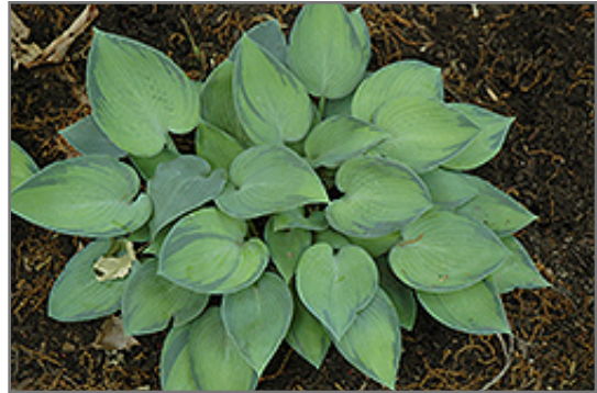
Paradise Joyce Hosta