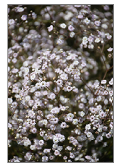
Festival White Baby's Breath flowers

This plant will require occasional maintenance and upkeep, and is best cleaned up in early spring before it resumes active growth for the season. Gardeners should be aware of the following characteristic(s) that may warrant special consideration;