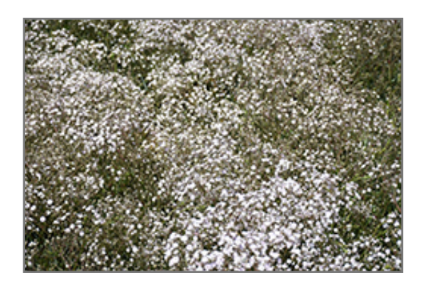
Festival White Baby's Breath in bloom