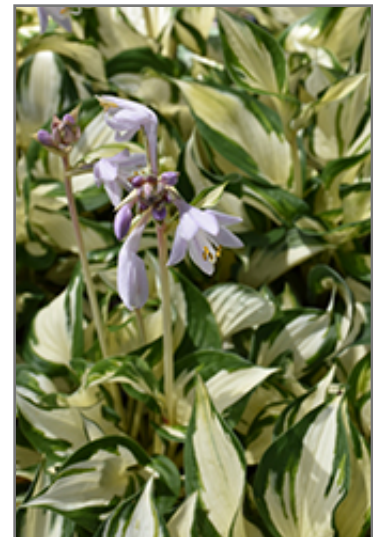
Loyalist Hosta flowers