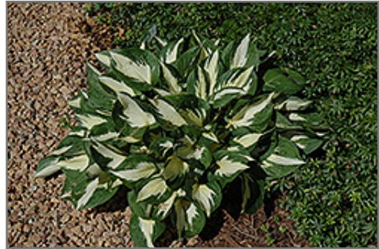
Loyalist Hosta