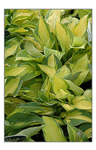
Little Sunspot Hosta foliage

A compact variety producing dense mounds of golden yellow foliage with deep green margins and variegation; white with lavender flowers appear on tall scapes during the midsummer months; adds color, contrast and texture to beds, borders and containers