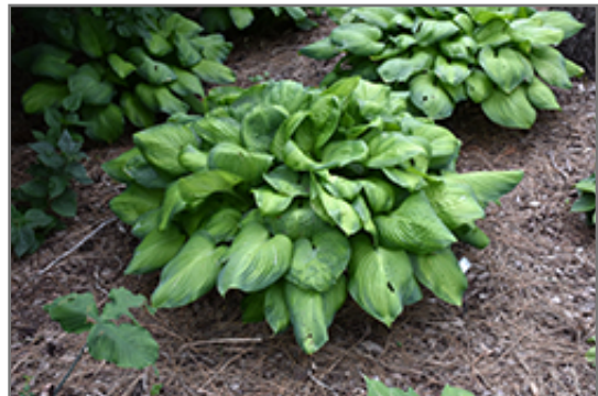
Guacamole Hosta