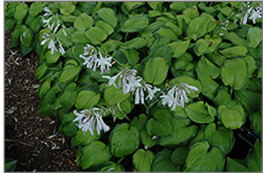
Guacamole Hosta in bloom

Guacamole Hosta will grow to be about 24 inches tall at maturity extending to 3 feet tall with the flowers, with a spread of 4 feet. When grown in masses or used as a bedding plant, individual plants should be spaced approximately 3 feet apart. Its foliage tends to remain dense right to the ground, not requiring facer plants in front. It grows at a medium rate, and under ideal conditions can be expected to live for approximately 10 years. As an herbaceous perennial, this plant will usually die back to the crown each winter, and will regrow from the base each spring. Be careful not to disturb the crown in late winter when it may not be readily seen!