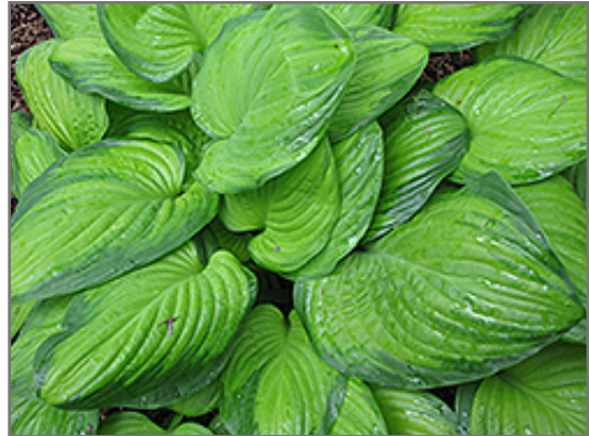
Guacamole Hosta foliage