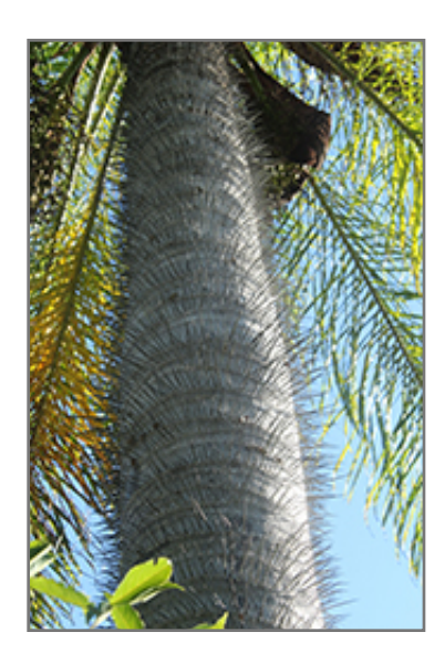
Macauba Palm bark

This tropical plant should only be grown in full sunlight. It is very adaptable to both dry and moist growing conditions, but will not tolerate any standing water. It is considered to be drought-tolerant, and thus makes an ideal choice for xeriscaping or the moisture-conserving landscape. This plant does not require much in the way of fertilizing once established. It is not particular as to soil pH, but grows best in sandy soils, and is able to handle environmental salt. It is somewhat tolerant of urban pollution. This species is not originally from North America.