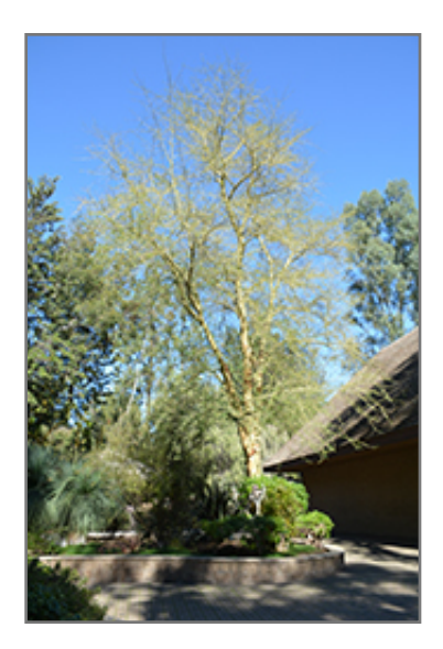
Fever Tree

Fever Tree is a multi-stemmed deciduous tree with an upright spreading habit of growth. Its relatively fine texture sets it apart from other landscape plants with less refined foliage.