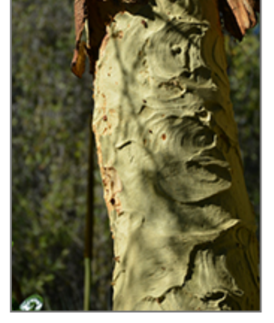
Fever Tree bark

Fever Tree will grow to be about 60 feet tall at maturity, with a spread of 50 feet. It has a low canopy with a typical clearance of 5 feet from the ground, and should not be planted underneath power lines. It grows at a fast rate, and under ideal conditions can be expected to live for approximately 30 years.