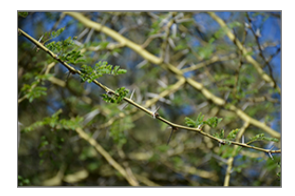
Fever Tree foliage