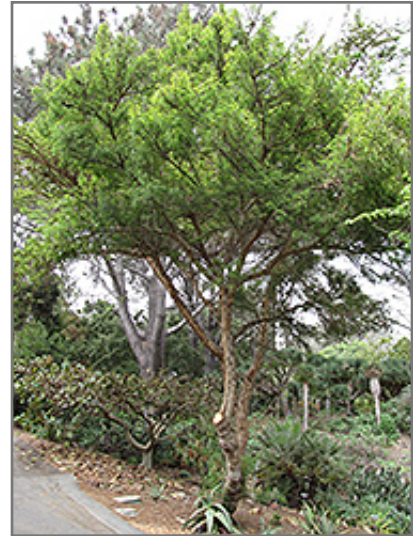
Red Acacia