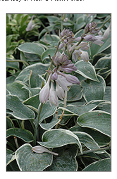
El Nino Hosta in bloom

This is a relatively low maintenance plant, and is best cleaned up in early spring before it resumes active growth for the season. Gardeners should be aware of the following characteristic(s) that may warrant special consideration;