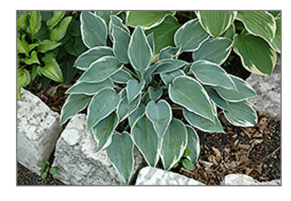
Fl Nino Hosta

El Nino Hosta is a dense herbaceous perennial with tall flower stalks held atop a low mound of foliage. Its medium texture blends into the garden, but can always be balanced by a couple of finer or coarser plants for an effective composition.