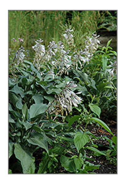
Blue Wedgewood Hosta in bloom