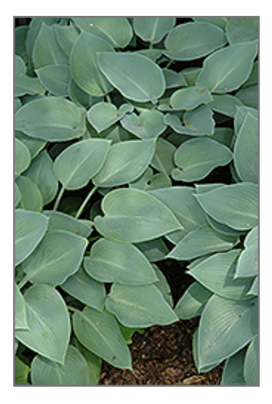
Blue Wedgewood Hosta foliage

This is a relatively low maintenance plant, and is best cleaned up in early spring before it resumes active growth for the season. Gardeners should be aware of the following characteristic(s) that may warrant special consideration;