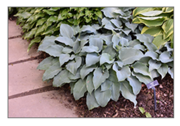
Blue Wedgewood Hosta

Blue Wedgewood Hosta will grow to be about 18 inches tall at maturity extending to 28 inches tall with the flowers, with a spread of 28 inches. When grown in masses or used as a bedding plant, individual plants should be spaced approximately 24 inches apart. Its foliage tends to remain dense right to the ground, not requiring facer plants in front. It grows at a medium rate, and under ideal conditions can be expected to live for approximately 10 years. As an herbaceous perennial, this plant will usually die back to the crown each winter, and will regrow from the base each spring. Be careful not to disturb the crown in late winter when it may not be readily seen!