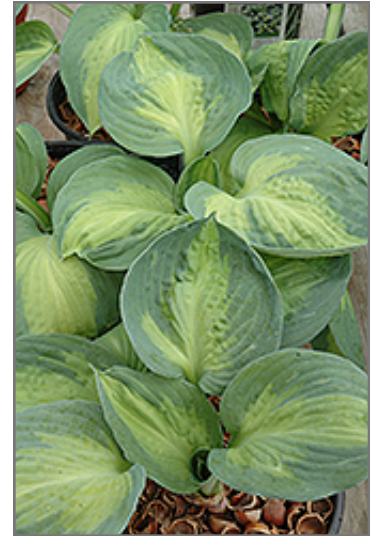
Adrian's Glory Hosta foliage

Adrian's Glory Hosta is recommended for the following landscape applications;