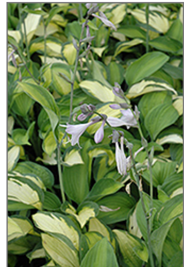
Adrian's Glory Hosta in bloom