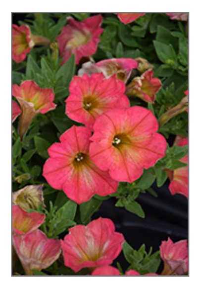
Supertunia Persimmon Petunia flowers

A vigorous, self cleaning series providing stunning color as both a spiller or thriller in hanging baskets and containers; brightly colored flowers bloom throughout the season for added interest; heat and drought tolerant; great choice for border fronts