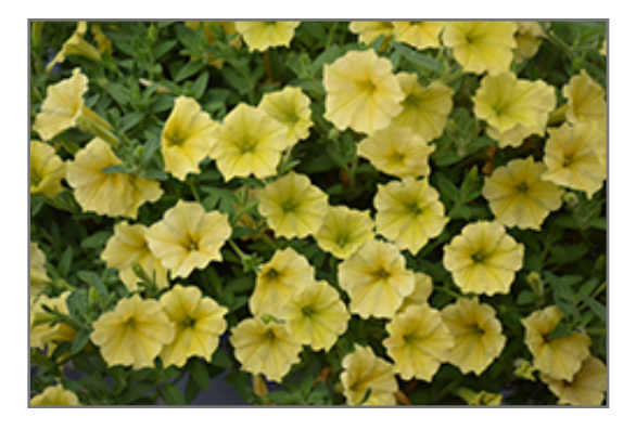
Supertunia Mini Vista Yellow Petunia flowers

Supertunia Mini Vista Yellow Petunia is a dense herbaceous annual with a trailing habit of growth, eventually spilling over the edges of hanging baskets and containers. Its medium texture blends into the garden, but can always be balanced by a couple of finer or coarser plants for an effective composition.