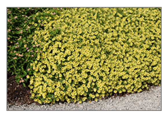
Supertunia Mini Vista Yellow Petunia in bloom

This plant will require occasional maintenance and upkeep. Trim off the flower heads after they fade and die to encourage more blooms late into the season. It is a good choice for attracting butterflies and hummingbirds to your yard, but is not particularly attractive to deer who tend to leave it alone in favor of tastier treats. It has no significant negative characteristics.