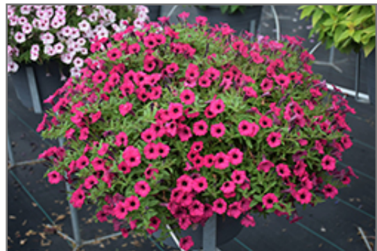
Supertunia Mini Vista Sweet Sangria Petunia in bloom