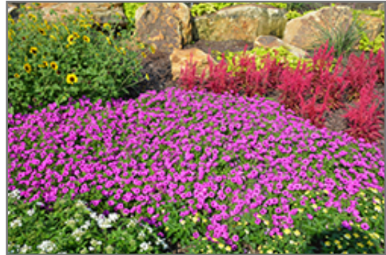
Supertunia Mini Vista Sweet Sangria Petunia in bloom