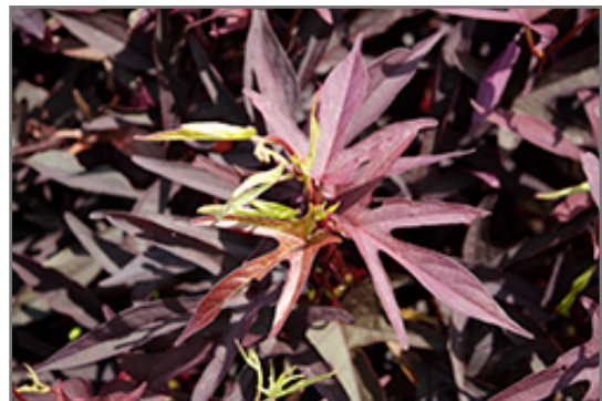
Sweet Caroline Upside Black Coffee Sweet Potato Vine foliage