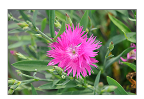
Supra Purple Pinks flowers

Supra Purple Pinks is recommended for the following landscape applications;