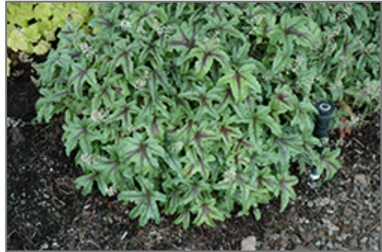
Kimono Foamy Bells