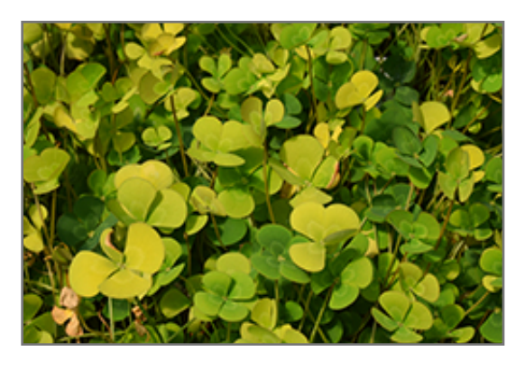
Four Leaf Water Clover foliage

This is a high maintenance plant that will require regular care and upkeep, and is best cleaned up in early spring before it resumes active growth for the season. Gardeners should be aware of the following characteristic(s) that may warrant special consideration;