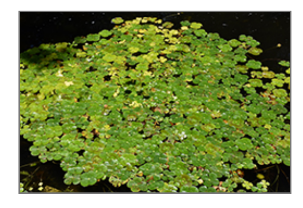
Four Leaf Water Clover

Four Leaf Water Clover is a dense herbaceous perennial with a low habit of growth, spreading atop the surface of the water. Its relatively fine texture sets it apart from other garden plants with less refined foliage.